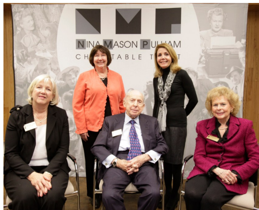
Above: Tangram representatives accept a check from Nina Mason Pulliam Charitable Trust.

Tangram was recently granted $60,000 by Nina Mason Pulliam Charitable Trust to expand our current foundation of employment-related opportunities, including employment plan development and job-related training, through our Empowerment for Employment program. The purpose of this program is to build upon what we have learned over the past few years regarding employment for those with disabilities and to assist individuals with securing employment through volunteer opportunities, internships and